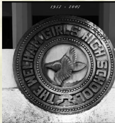
AARTHA SHANTI PHALA VIDYA