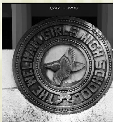
AARTHA SHANTI PHALA VIDYA

This issue is full of endings and beginnings. Some happy moments and some nostalgic ones. Some things to look forward to, some to sigh over and miss. But as always, there is good cheer, bonhomie and the perpetual Welham spirit. It's not possible to quell that!