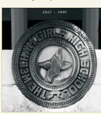
AARTHA SHANTI PHALA VIDYA

since its official birth, to put together a strong network that the alumnae can be justly proud of, and also one that can actively participate in help taking our School forward to its natural place on the leader board for education.